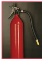
Just 6" of Scenic holds this heavy fire extinguisher in a vertical wall!

SPECIFICATIONS: Width: 1/2" (12.7 mm) Length: 109' (33.22 m) CAUTION: All tape has latex in the adhesive.